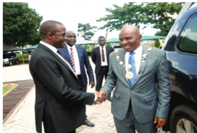
LR: ICPC Chairman and President ICAN

ICPC has established a strategic collaboration with the Institute of Chartered Accountants of Nigeria (ICAN) ; ensuring accountability and transparency in the public sector through the accounting profession; and playing a strategic role in preventing corrupt practices in the public service.