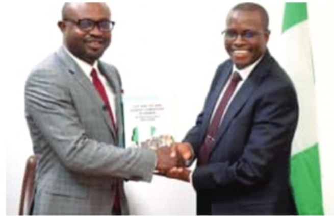
LR: Hon Tunji-Ojo Olubunmi and the ICPC Chairman

The Hon Minister of Interior, Hon Tunji-Ojo Olubunmi and the ICPC Chairman met at the ICPC headquarters for a strategic alliance geared towards enhancing service delivery and giving Nigeria a better and reputable image in the comity of nations.