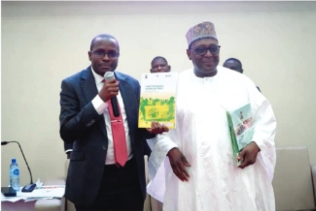
L-R ICPC Chairman with Hon Minister of Health, Muhammad Ali Pate

ICPC collaborated with the Federal Ministry of Health and other critical stakeholders in the health sector to proffer solutions to corruption within the healthcare delivery system. An MoU for Corruption Prevention and more efficient service delivery, which is applicable to the entire health sector is waiting to be signed.