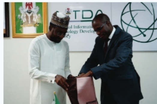
L-R: NITDA Director General and the ICPC Chairman