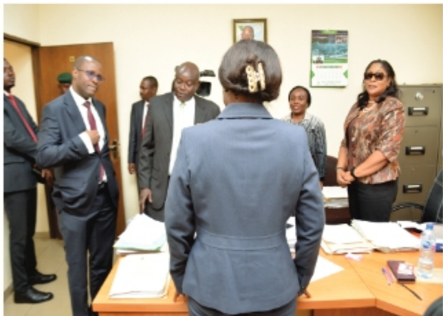
Briefing by the head of Special Services Department

As part of his first official engagements, the Chairman took a tour of all the departments, Divisions, Units, and Detention centres, smiling and greeting every staff.