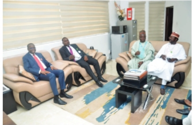
ICPC Chairman with Prince Kayode Akiolu, Chairman of the House of Reps Committee on Anti-Corruption on a visit to ICPC