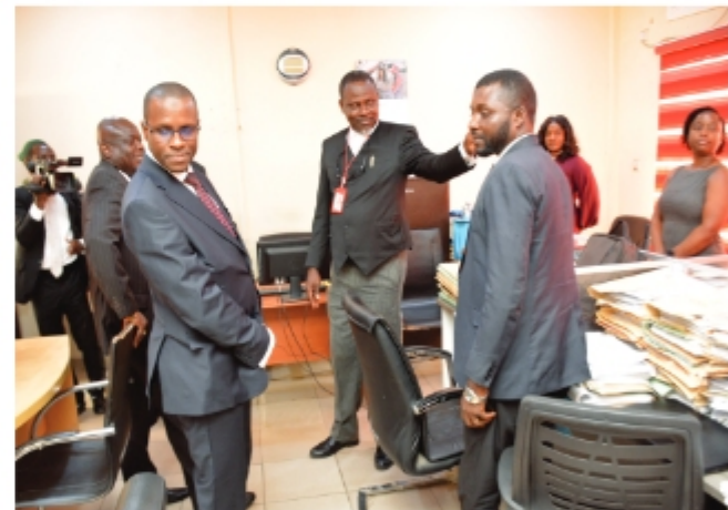
Briefing by head of Legal Services Department