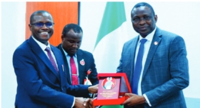
LR: ICPC Chairman with EFCC Chairman Olanipekun Olukoyede

ICPC has taken an important step in strengthening its partnership with the Economic and Financial Crimes Commission (EFCC), demonstrating its full commitment to enhancing inter-agency collaboration.