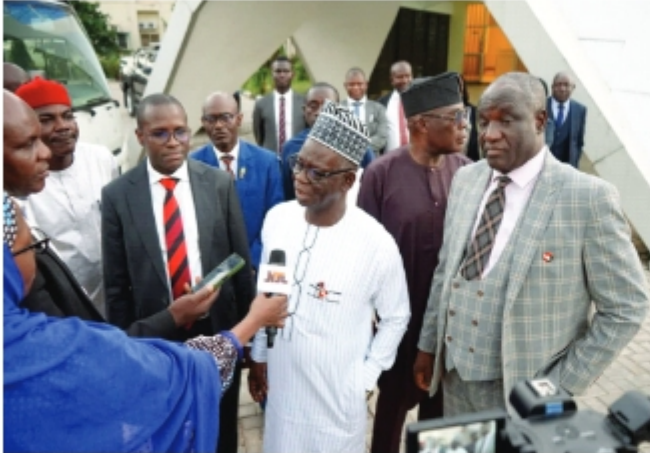
Chairman, Senate Committee on Anti-Corruption's visit to the ICPC