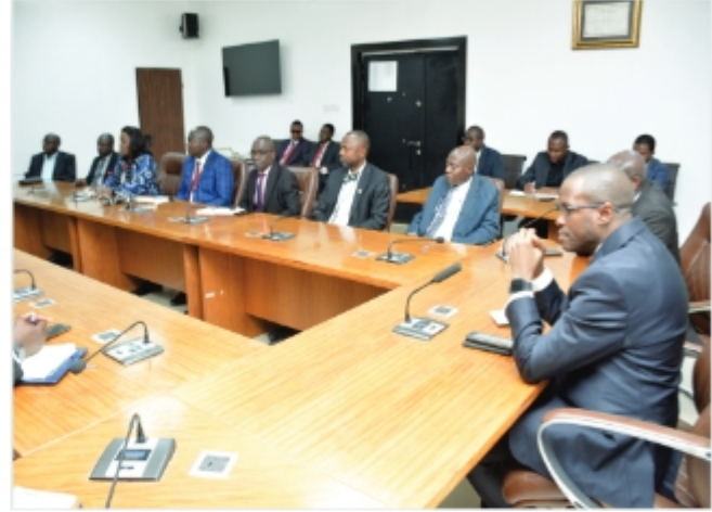
The Chairman with ICPC Management staff