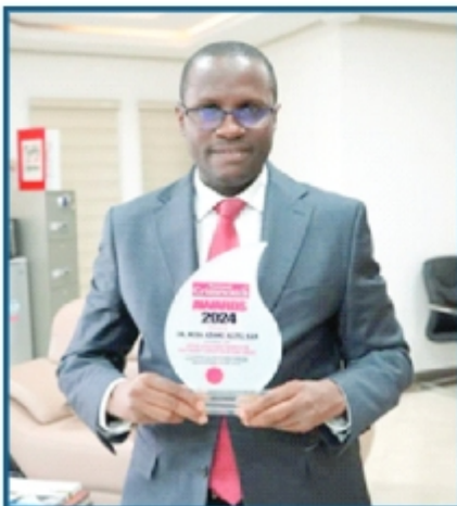
2024 Lifetime Achievement Award in the Fight Against Corruption in Public Service by National Crimewatch Magazine.