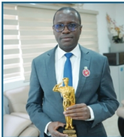
2024 Best in Diligent Investigation and Recovery by The Security and Emergency Management Award (SAEMA).