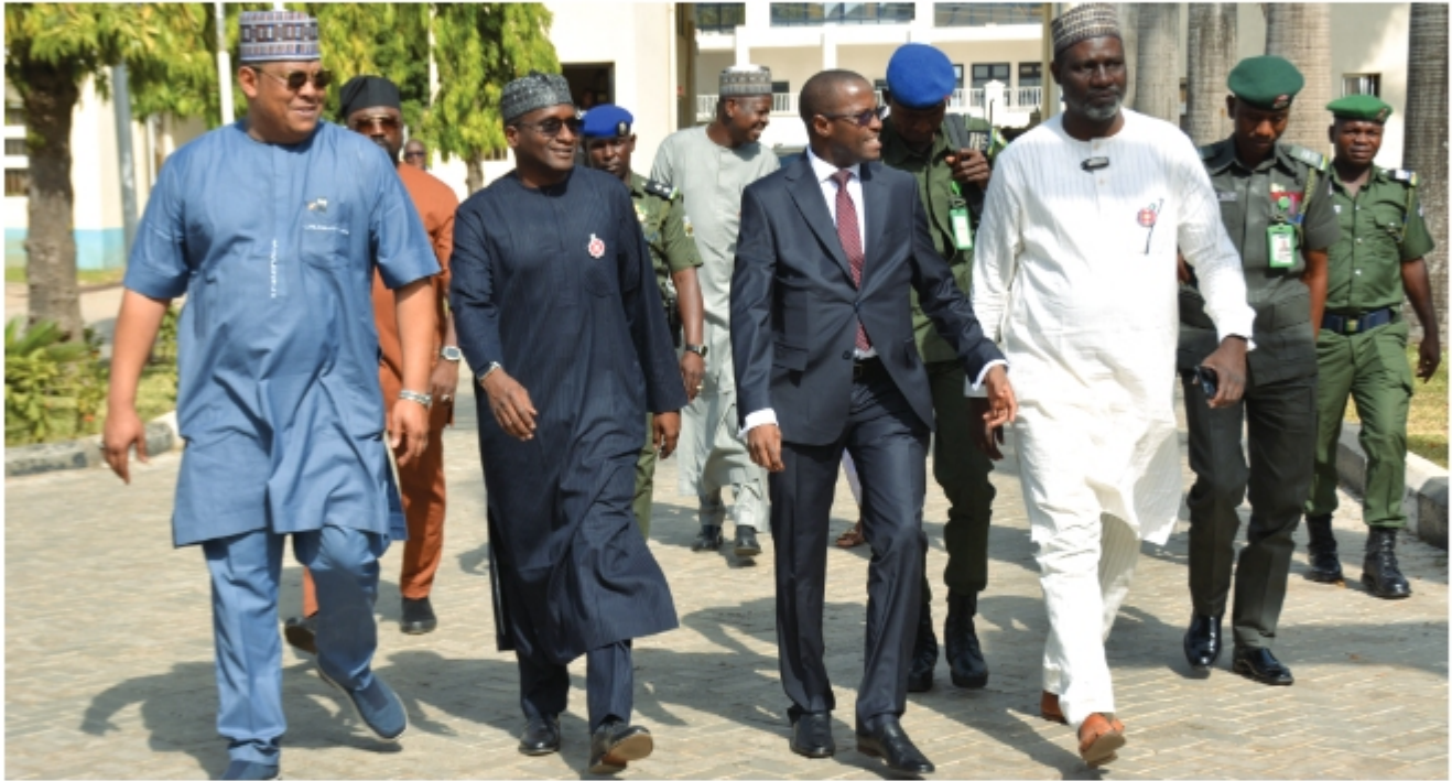
2nd L-R Chairman walking into ICPC Premises.