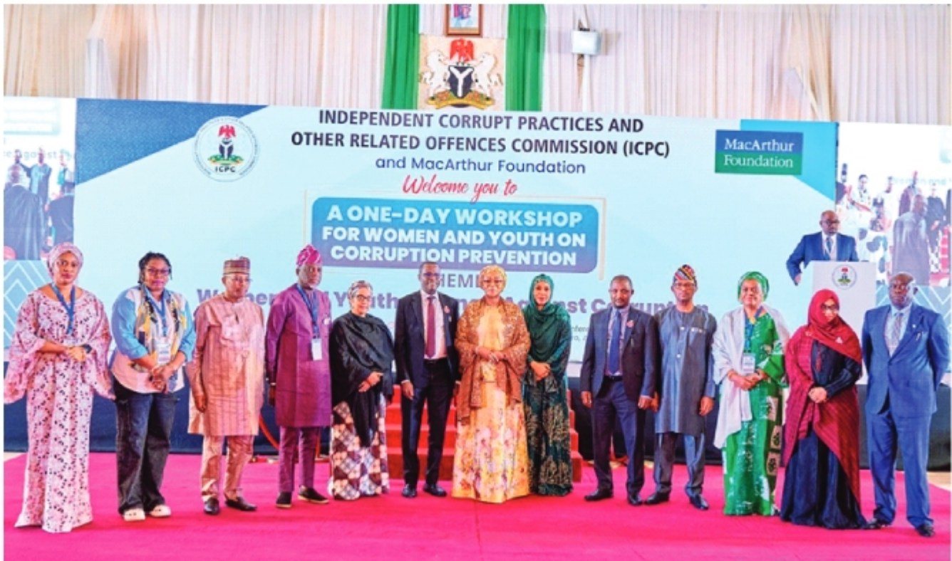
5th L-R: ICPC Chairman with the First Lady at the Roundtable held at the State House

ICPC organised a one-day workshop on the theme: "Women and Youth Alliance against Corruption", providing women and youth with insights into the complexities of corruption, its impact on societies and offering them the platform for effective preventive strategies. The one-day Workshop was honoured with the full participation of the First Lady of the Federal Republic of Nigeria, Senator Mrs. Oluremi Tinubu, CON OON.