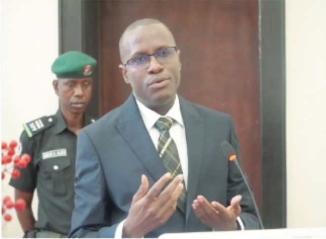
The Chairman addressing staff on assumption.