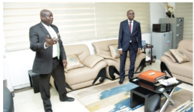
ICPC Secretary showing the Chairman his office