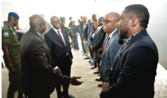
ICPC Secretary introducing Staff