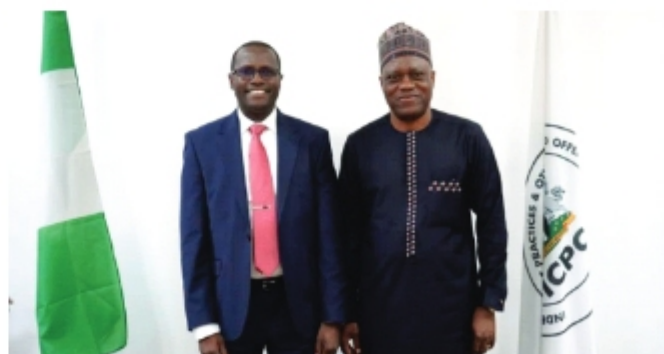
LR: ICPC Chairman with the Statistician-General of the Federation, Prince Adeyemi Adeniran

The Statistician-General of the Federation, Prince Adeyemi Adeniran, seeks to collaborate with ICPC on the National Corruption Survey that will help the government in the area of policy-making.