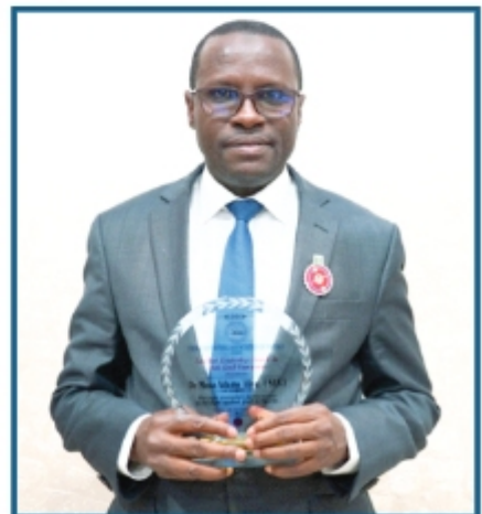
Excellent Leadership Award for Anti-Graft Efforts by Crime Reporters Association of Nigeria (CRAN).