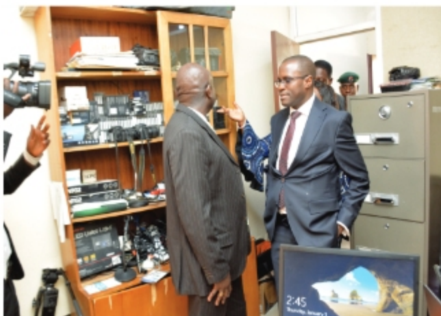
Tour of Audio Visual Unit of PEED