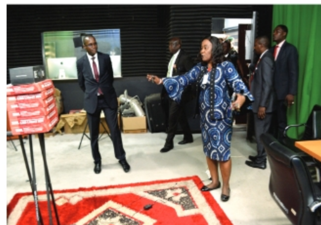
Chairman's tour of Production Studio