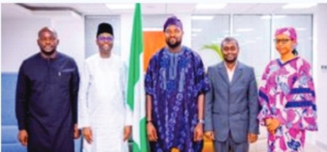
2nd L-R ICPC Chairman, Hon. Minister of Communications, Dr. Bosun Tijjani