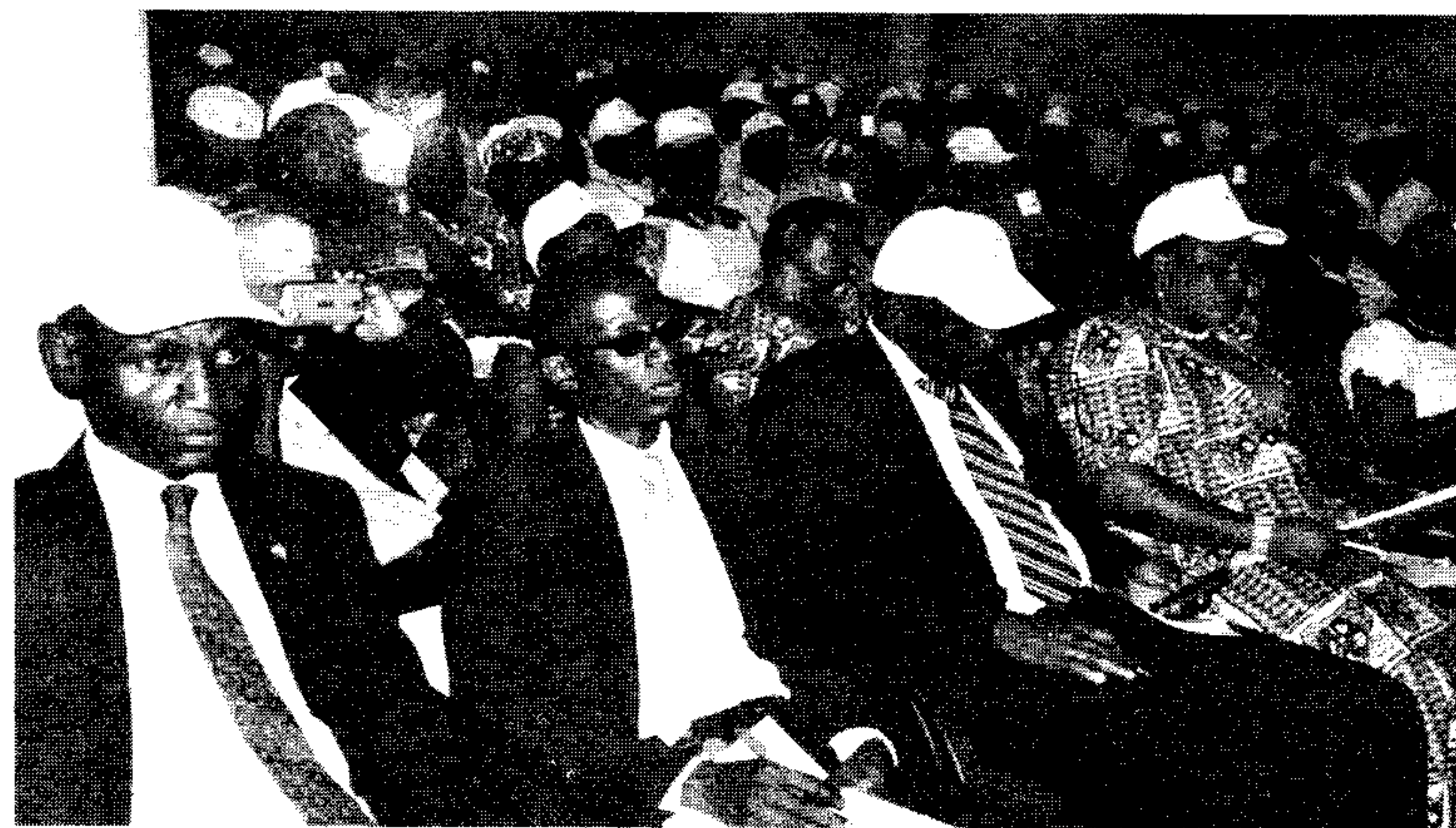
A cross-section of participants at the Anti-corruption day

A lot of questions regarding the activities of various anti-corruption agencies were asked and representatives of the agencies present were able to enlighten the people. For effective communication, a native of the town translated whatever was said in English to the local dialect.