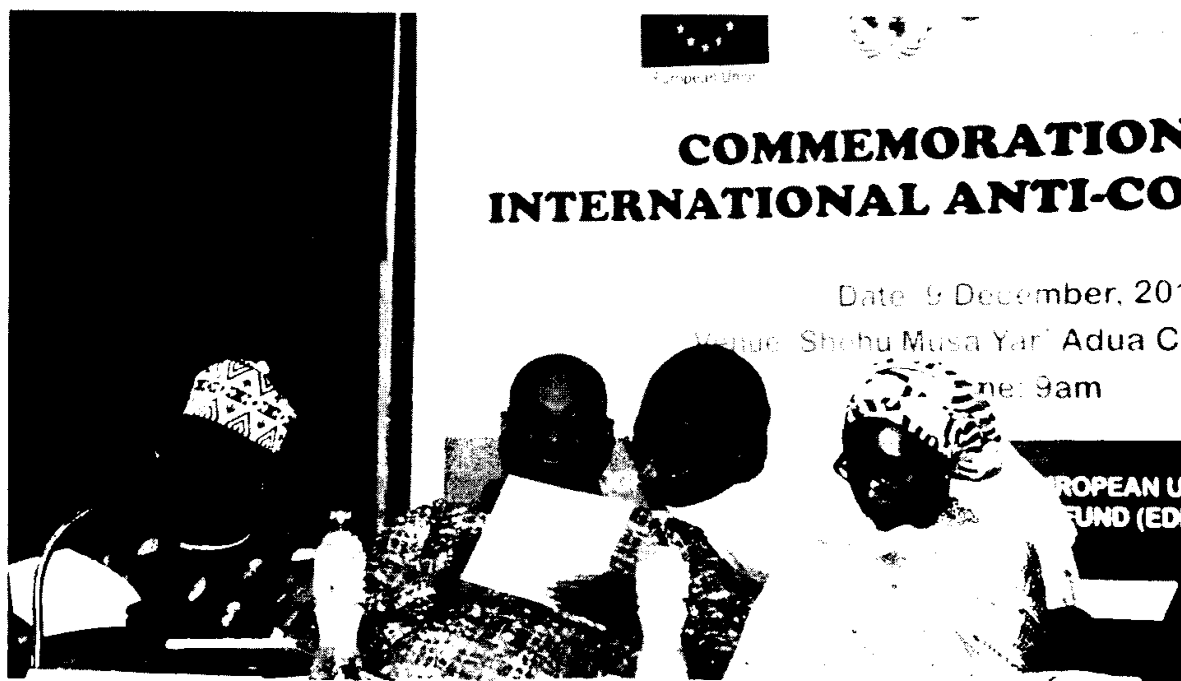
Some of the IATT members at the Anti-corruption day

The theme for this year's celebration which was "Zero Corruption, 100%