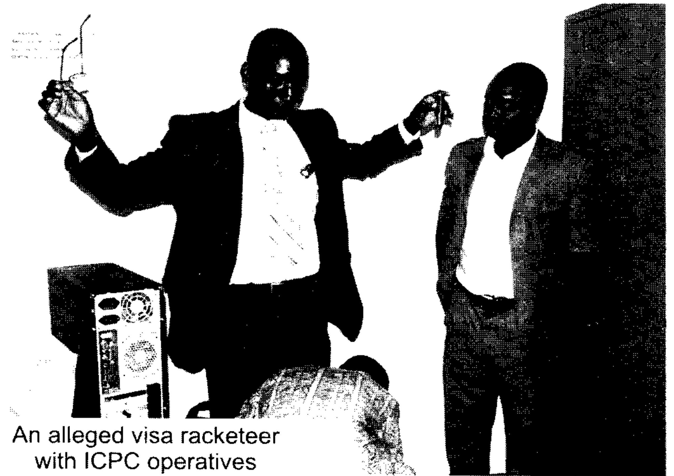
An alleged visa racketeer with ICPC operatives

departments, travel agencies and embassies.