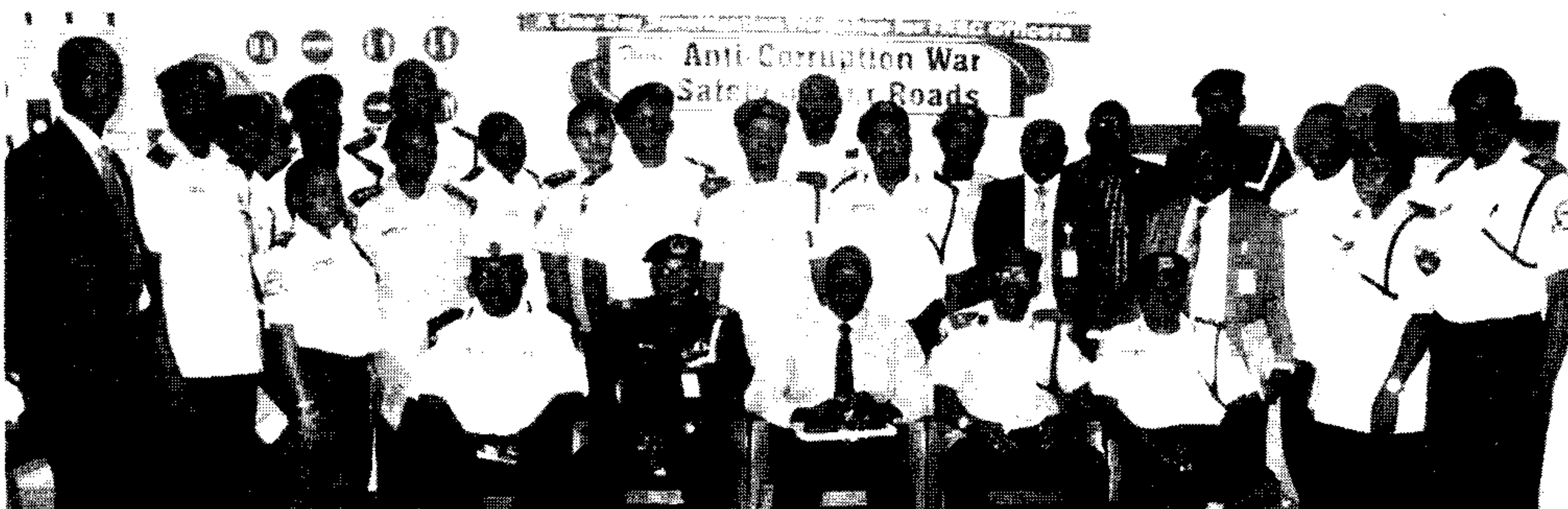
Group photograph of participants at the workshop