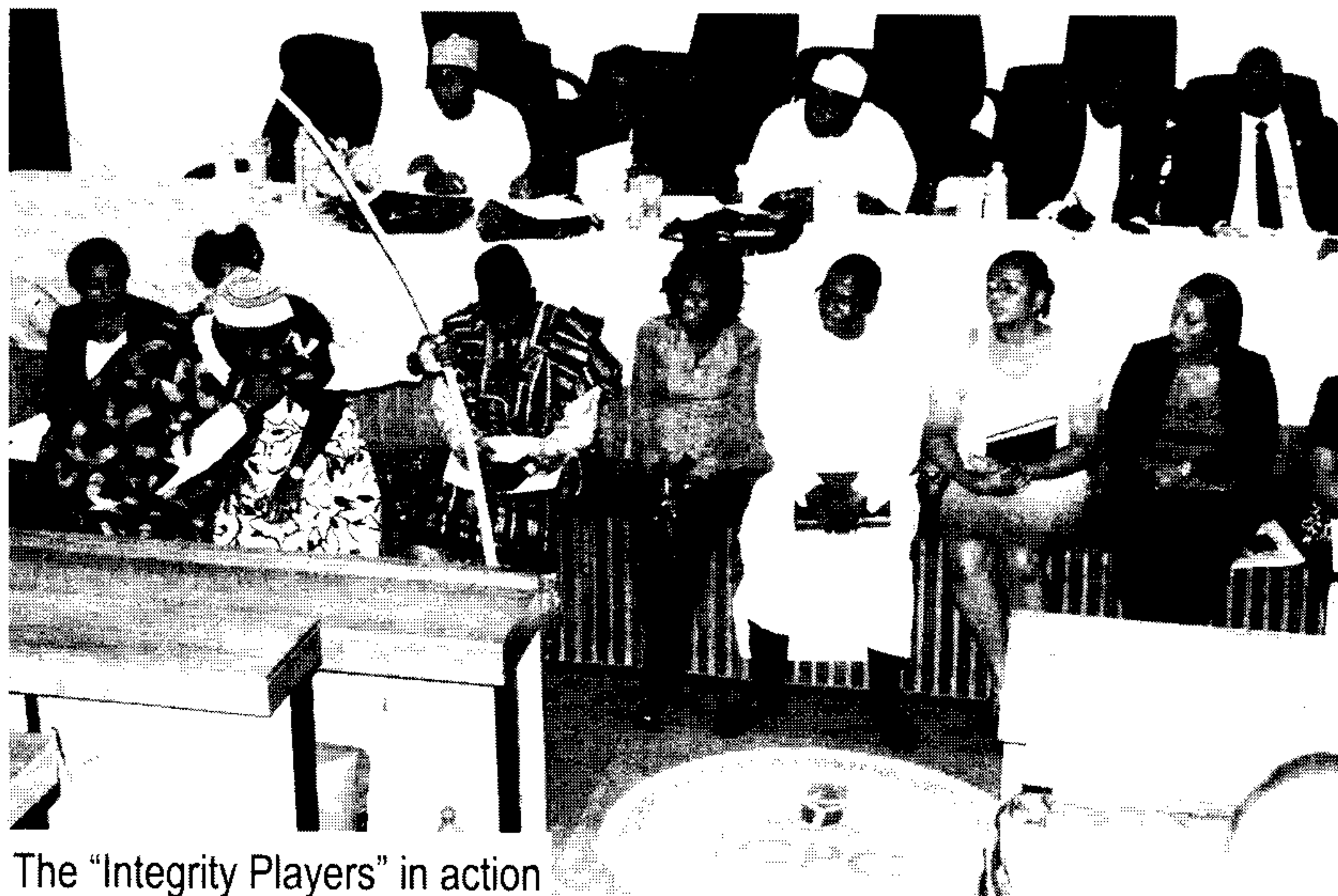
The "Integrity Players" in action