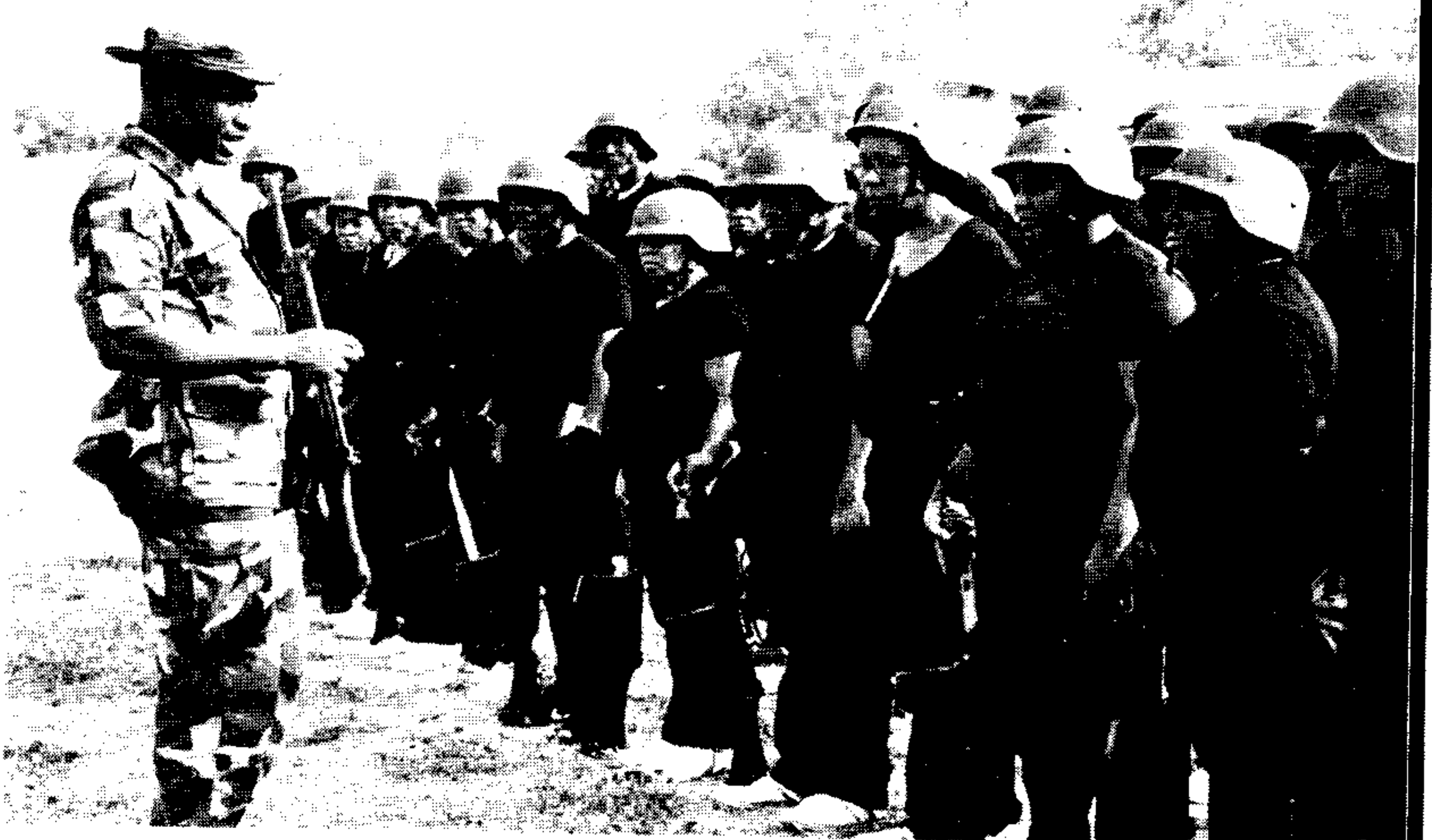
Some ICPC Staff being drilled by a soldier

Responding, the Commanding Officer thanked the ICPC Chairman for considering the Battalion worthy to train staff of the Commission adding that from his interaction with officers of ICPC the training would be quite useful to their career.