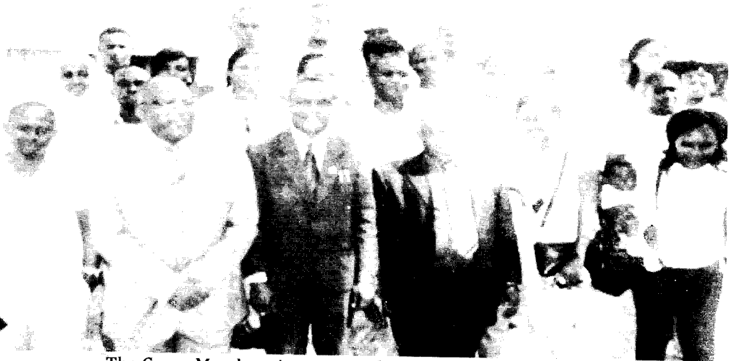
The Corps Members in a group photograph with management team of the Academy