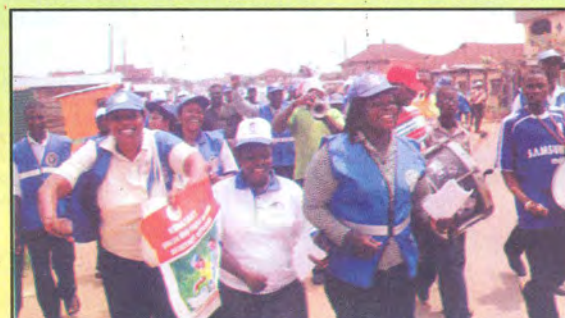
NAVC members on anti-computers sensitisation rally in Ondo