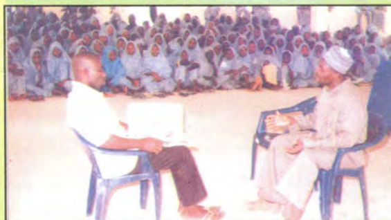
Scene of a Drama Presentation @ Government Girls' Secondary School, Yana, Shira Local Government, Bauchi State