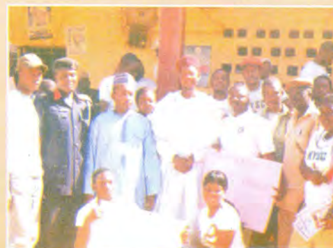
Illela L.G Chairman, O/C Civil Defence, O/C Immigration, NAVC Co-ordinator Illela and Other NAVC Members in a group photograph