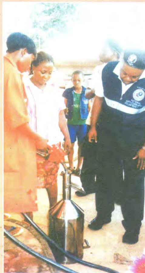
Onitsha South NAVC Coordinator Supervising Sale of Dwell Fuel Filling Station, Onitsha