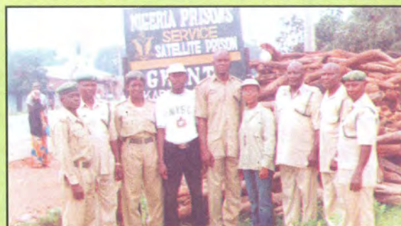
An NAVC/NYSC CDS member in a group photo with officials of Makurdi prison after a Sensitisation programme