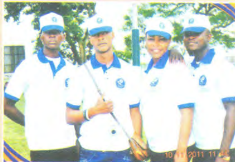
Excited members of NAVC at the inauguration of Edo state Chapter.